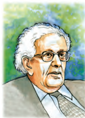
Dr Homi Sethna

India successfully performed her first nuclear test at Pokharan in Rajasthan on 18 th May 1974 in consonance with the policy of using nuclear energy for peaceful purposes