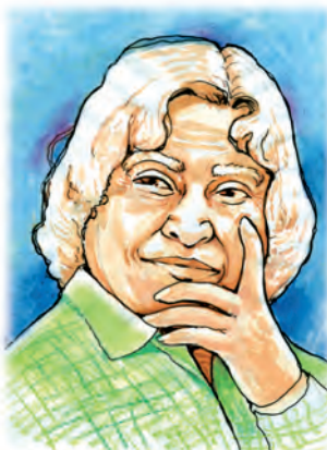
Dr APJ Abdul Kalam

Prithvi : In 1988, India successfully tested the missile Prithvi and in 1989, the missile Agni. The entire world took note of India's programme of developing nuclear missiles indigenously.