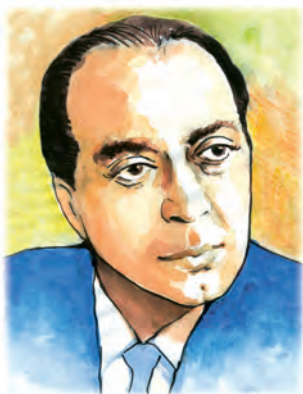
Dr Homi Bhabha

India's first Prime Minister Pandit Jawaharlal Nehru wanted to nurture a scientific temper and bring about the nation's progress. From this perspective, he set up the Indian Atomic Energy Commission on 10 th August 1948. Dr Homi Bhabha was appointed as the first Chairman of the Commission. The objectives of the commission were to produce electricity from atomic energy, increase the yield of food grains and make them last longer, set up the technology for achieving this and develop nanotechnology. In 1956, the Department of Atomic Energy set up 'Apsara', a nuclear reactor functioning on atomic energy.